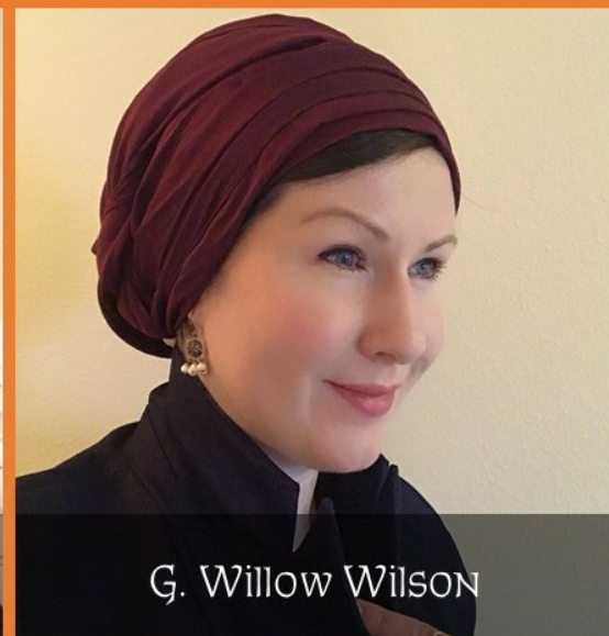
G. Willow Wilson